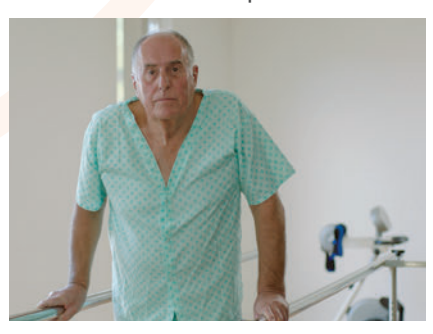
Patients want the most effective care - sometimes this includes different innovations.