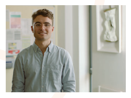
Innovators can say they don't know how the NHS process works.