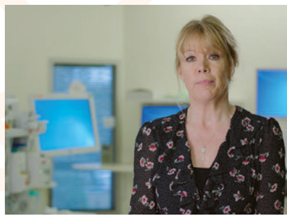
Businesses can say they waste too much time trying to find the right part of the NHS to speak to.