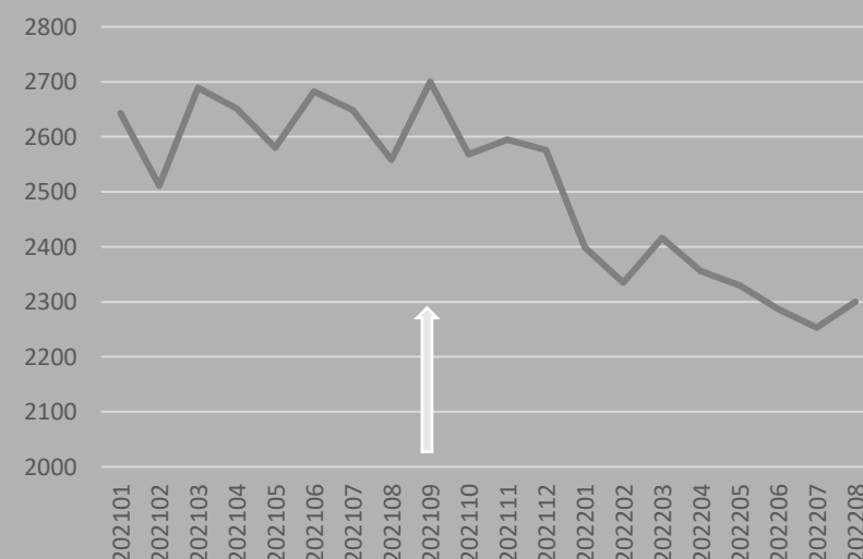
Figure 3 – Number of patients prescribed morphine sulfate 10mg/5ml oral solution