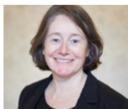
Professor Julia Newton, Medical Director, Health Innovation North East and North Cumbria (HI NENC)

Here in the North East and North Cumbria we have a high rate of opioid prescribing along with one of the highest rates of drug related deaths in the UK. In the NENC region, 20% of the most deprived people in the country take up 33% (approximately 1 million) of the region's population of approximately 3 million. 40% of the countries most deprived people take up 70% of the NENC population (over 2 million people).